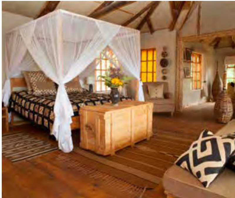
Virunga Volcanoes Lodge