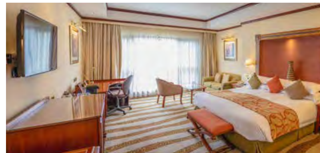
Radisson Blu Kigali