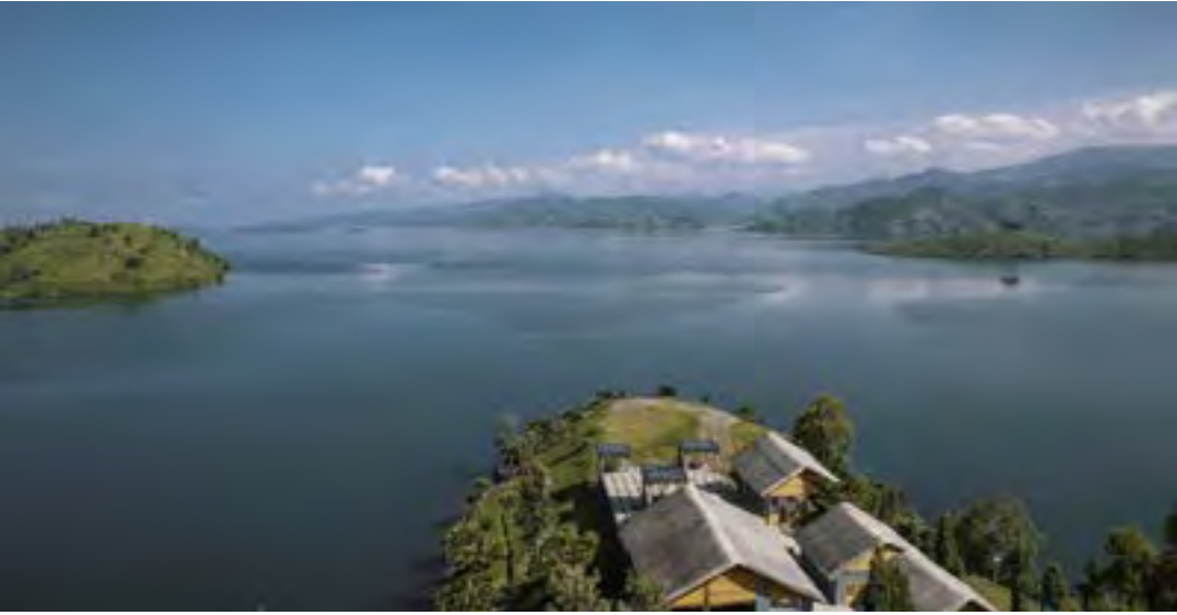
Cleo Lake Kivu Hotel