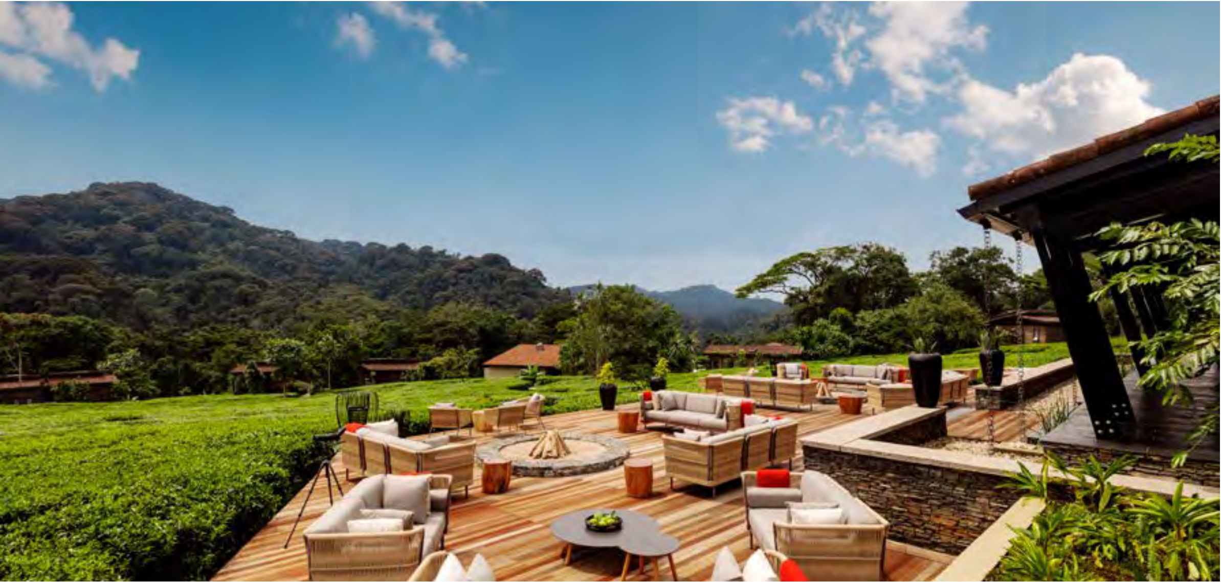
One&Only Nyungwe House