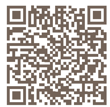
Download our Transfer Brochure

Uber Luxe Safaris takes pride in its partnership with Akagera Aviation. In providing Rwanda's helicopter services, Akagera Aviation provides both chartered and scheduled helicopter transfers between Kigali and Rwanda's main national parks – Volcanoes, Nyungwe and Akagera. They also service Gisenyi, Kibuya, Nyagatere and Kamembe airport.