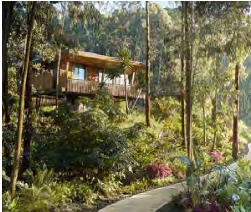
One&Only Gorillas Nest