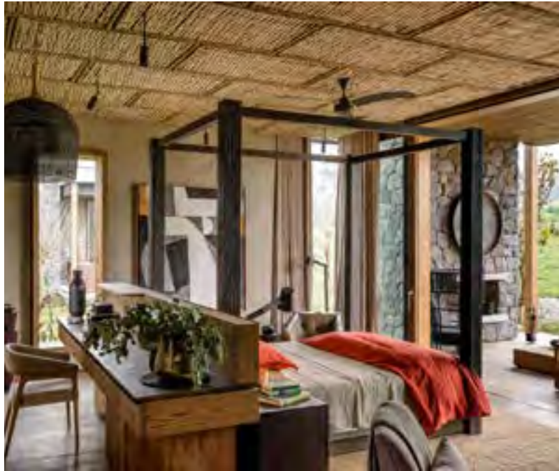
Singita Kataza House