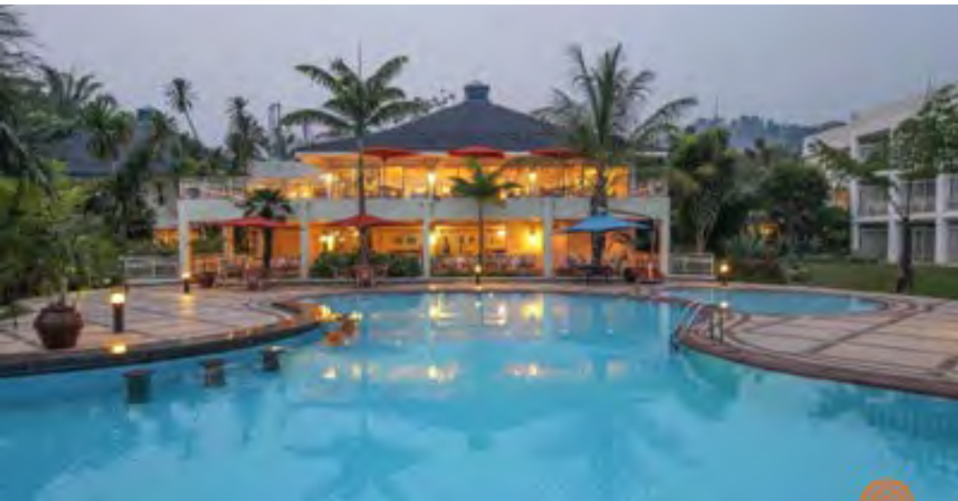
Lake Kivu Serena Hotel