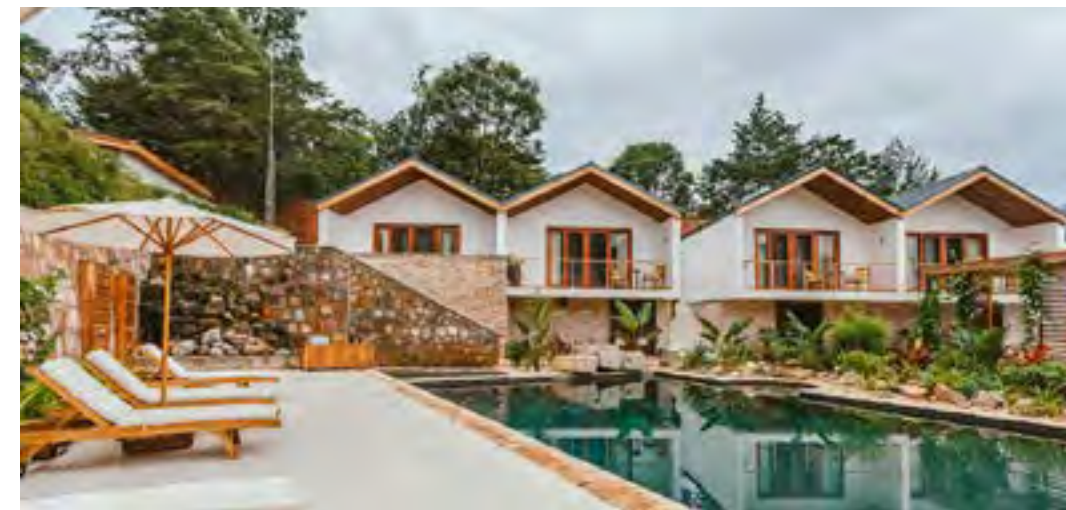
The Retreat Kigali