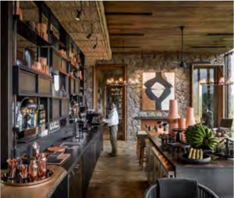
Singita Kwitonda House