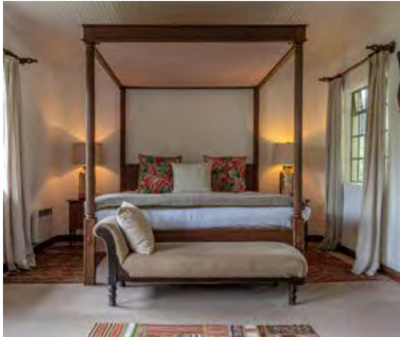
Sabyinyo Silverback Lodge