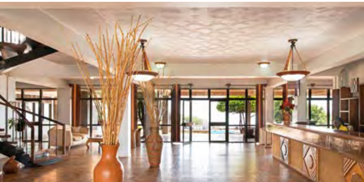
Akagera Game Lodge