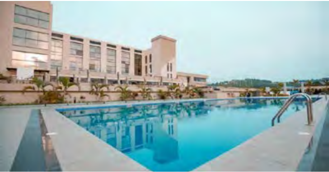
Mantis Kivu Marina Bay Hotel