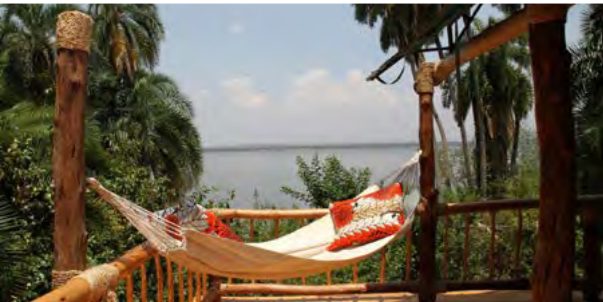
Ruzizi Tented Lodge