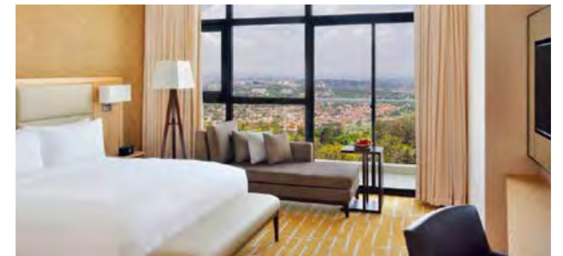
Kigali Marriott Hotel