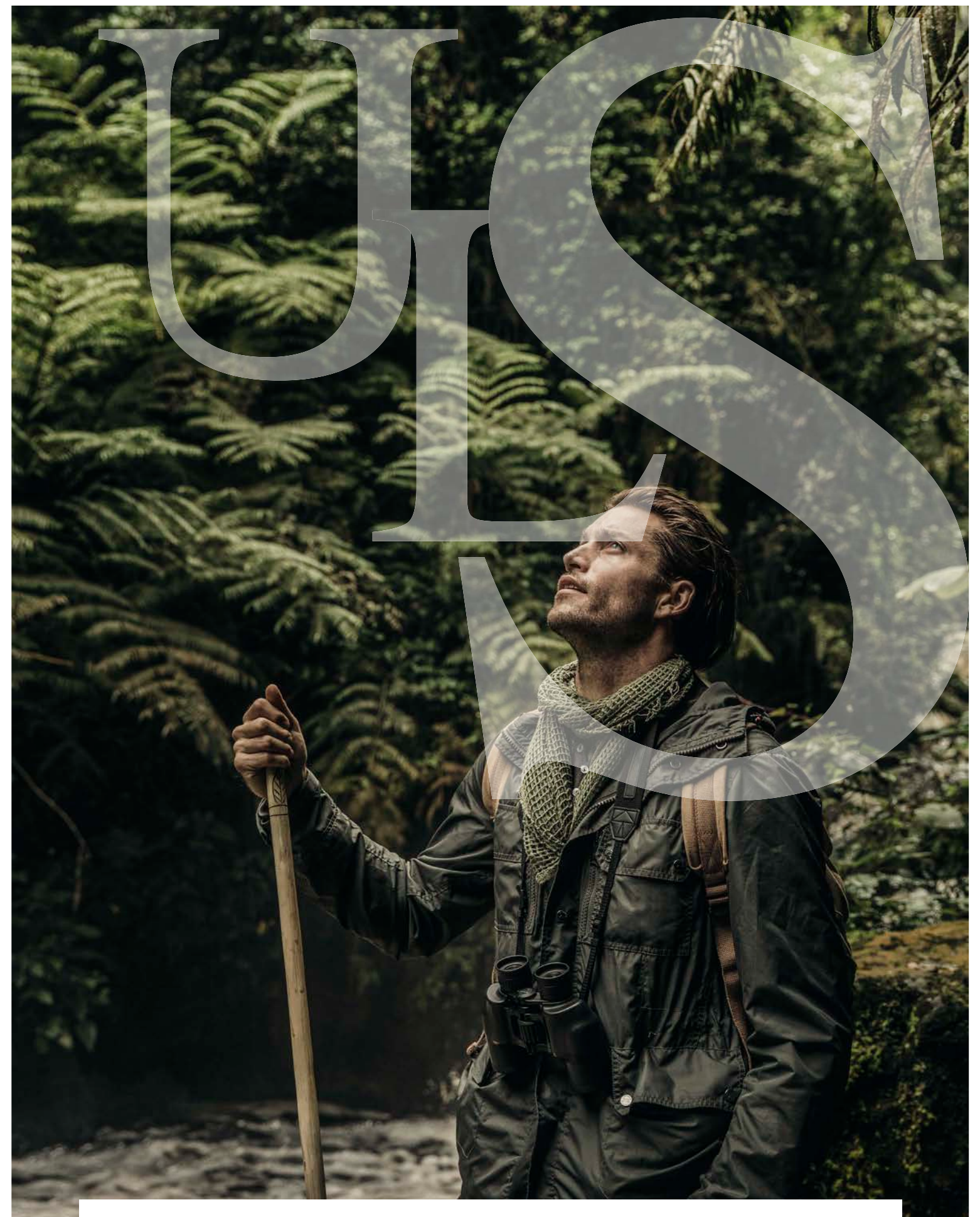
The Ultimate Bespoke Safari Experience