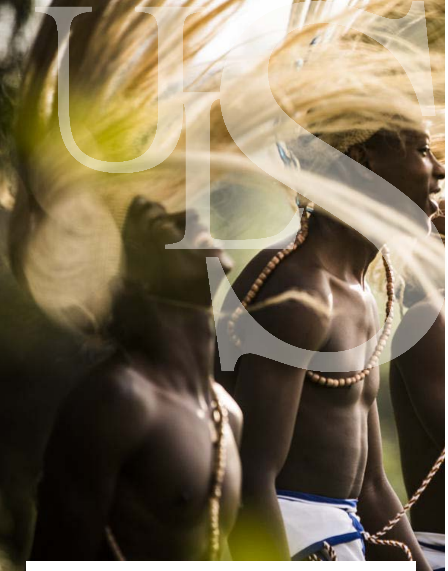
The Ultimate Bespoke Safari Experience