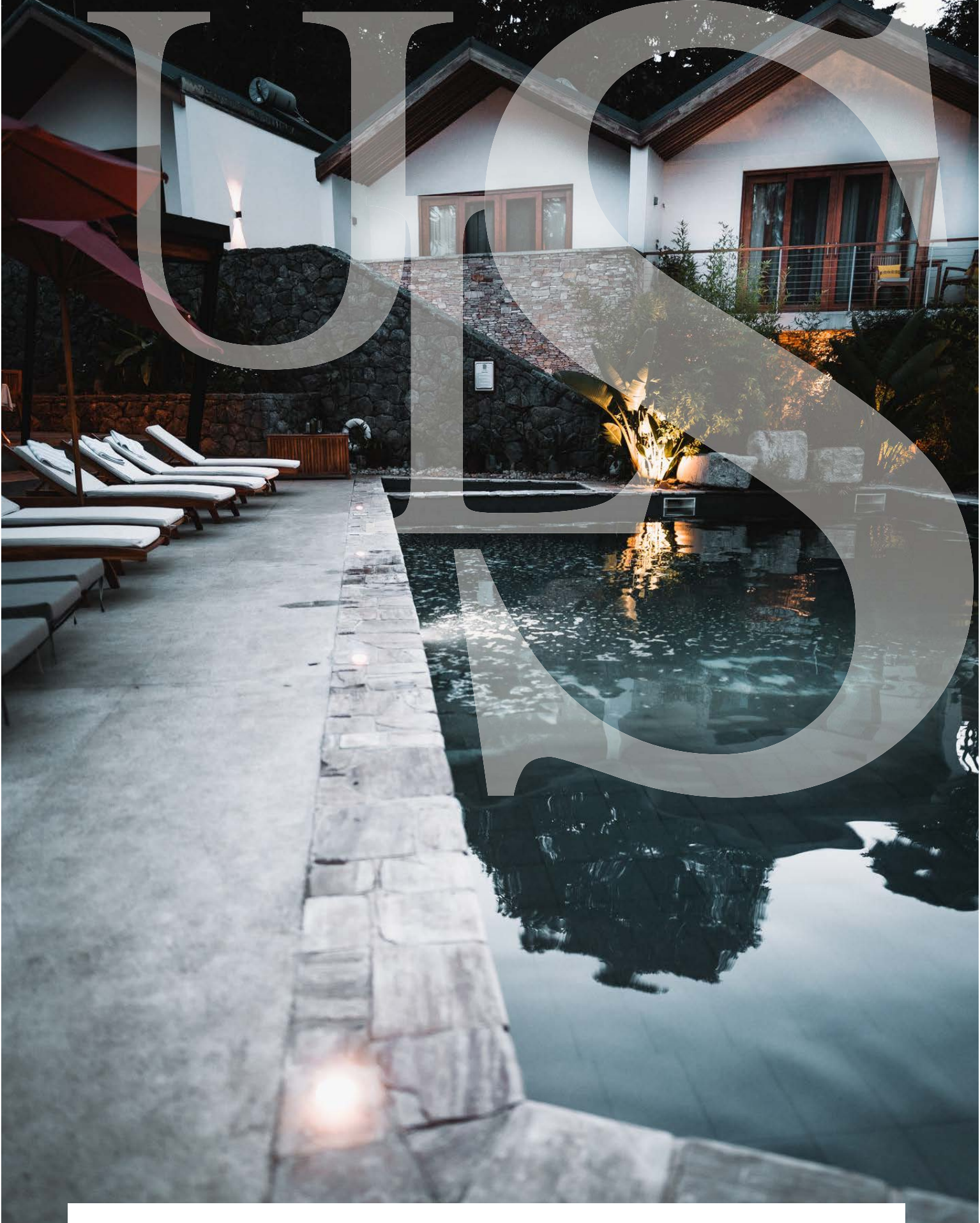
The Ultimate Bespoke Safari Experience